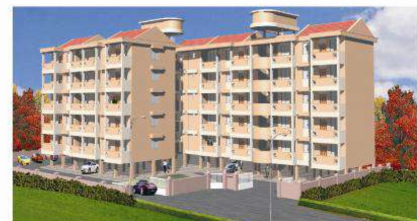
Kayji Height Margao - Goa.