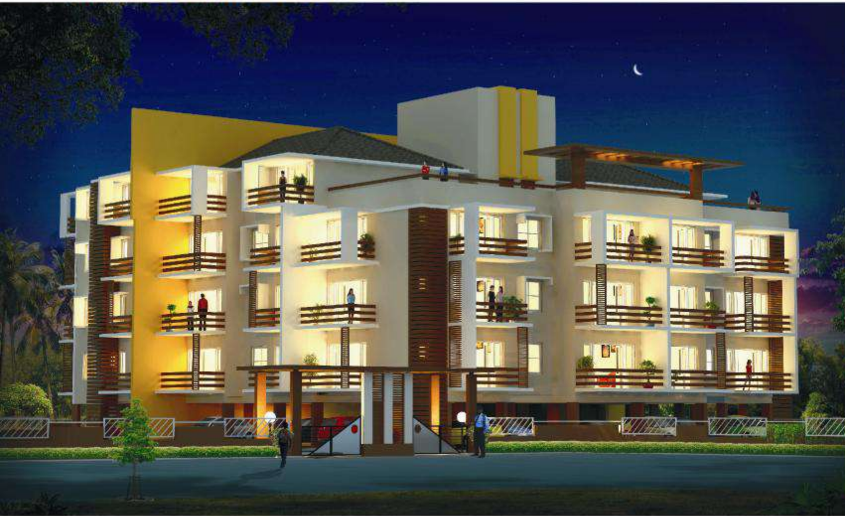
TYPICAL BUILDING VIEW