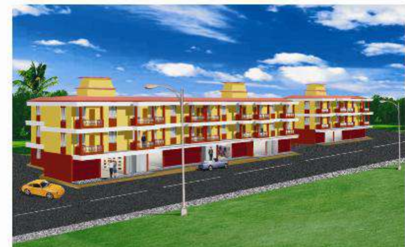
Kayji Residency Ponda - Goa.