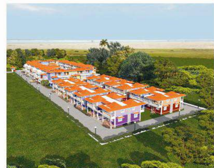
Le Cote D'Azur Carmona - Goa.

we at Kayji Real Estate don't just make buildings, we make Living Spaces. Every project is created keeping the customer at the epicenter. Care is taken to ensure that every need of the client is catered too. We do not just want to sell a house, shop or plot, we want to create a relationship for a life time. Our structures spell quality, aesthetics, technology, strength and most importantly TRUST.