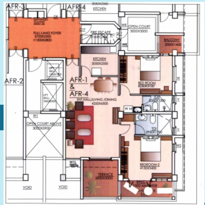
TYPICAL 2 BEDROOM APARTMENT ( AREA FROM - 121.5M 2 TO 149M 2 )